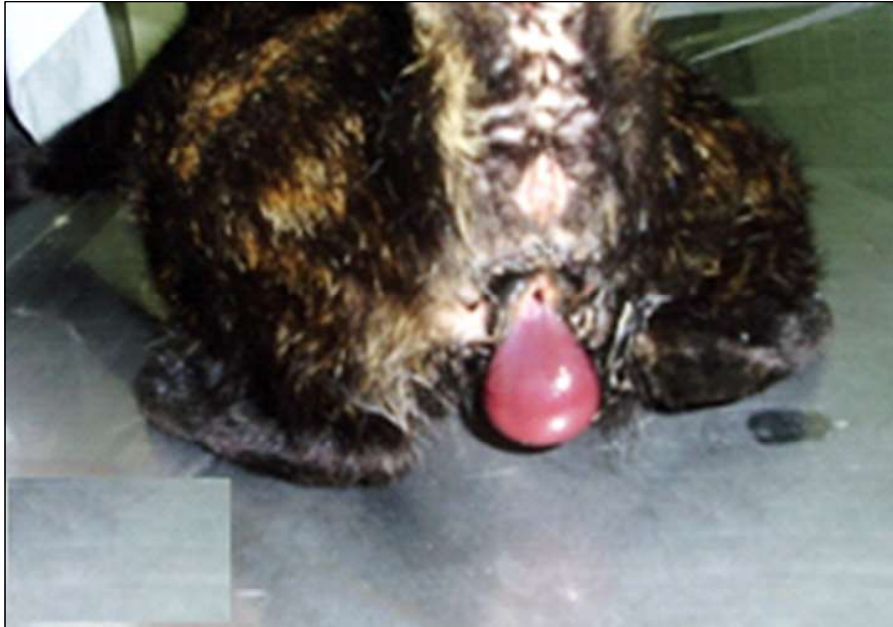
Figure 1- Female cat with dystocic parturition